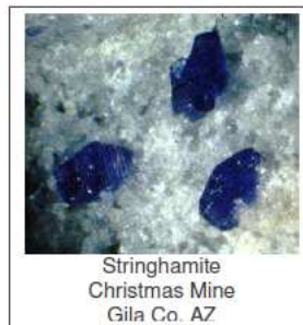
Stringhamite Christmas Mine Gila Co. AZ

True, there is a downside—a good stereomicroscope and light source are really necessary, but once you have these they should last a lifetime. Tools such as trimmers, picks, tweezers, mounting stands and boxes are inexpensive. The friendships that develop within the community are, as they say, priceless. Fm The RockCollector 10/2010