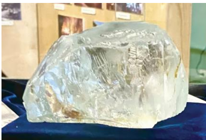
The largest blue topaz discovered in North America is on display in the Mason Square Museum.

Because of its hardness, the Texas topaz crystals resisted erosion and could be found on the surface and in stream gravels. Colors vary from clear to yellow and light brown, but the most desirable is light blue, now dubbed the Texas topaz.