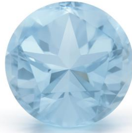
A Mason county blue topaz with a Lone Star cut.

Texas topaz was never mined commercially; it was always considered a hobbyist's gem. For years, Mason ranchers opened their properties to rockhounds, but as the discoveries dwindled over time and digging became more disruptive, the ranches were closed to the public. The last ranch allowing gem hunting discontinued access in 2023.